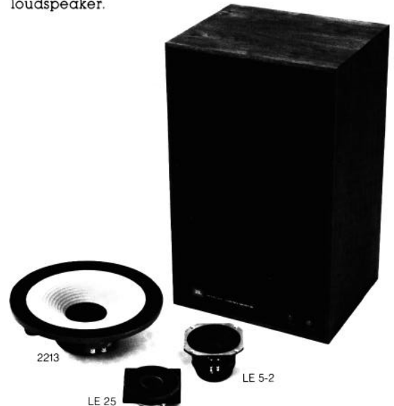
4311 Studio Monitor

As with all JBL loudspeaker systems, the component transducers, frequency dividing network and enclosure are designed and tested to function as a single, integrated unit. The enclosure is solidly constructed of 19-mm (3/4-in) stock throughout with wood-welded joints to prevent unwanted resonance. Internal padding absorbs spurious reflections and standing waves. All components mount directly to the baffle panel and are removable from the front of the enclosure. A ducted port provides proper acoustical loading of the low frequency loudspeaker.