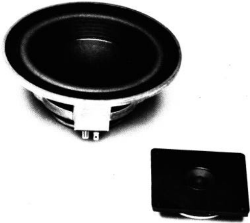
Loudspeaker system components of the 4301BE Energized Broadcast Monitor.

Frequency response of the 4301BE taken with \frac{1}{3} -octave band pink noise. Measured response of a typical production system averaged through an inclusive arc of 30^\circ vertically and horizontally does not deviate more than 3 dB from the above curve.