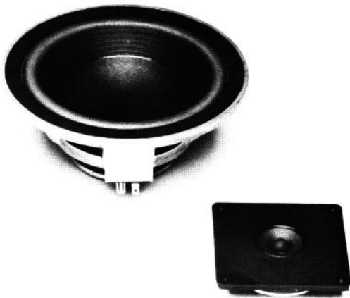
Loudspeaker system components of the 4301B Broadcast Monitor

Frequency response of the 4301B taken with 1/3-octave band pink noise. Measured response contour of a typical system averaged through an inclusive arc of 30° in the vertical and horizontal planes does not deviate more than 3 dB from the above curve.