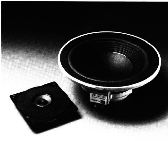
Loudspeaker system components of the 4301 Broadcast Monitor

Frequency response of the 4301 taken with 1/3-octave band pink noise. Measured response contour of a typical system averaged through an inclusive arc of 30° in the vertical and horizontal planes does not deviate more than 3 dB from the above curve.