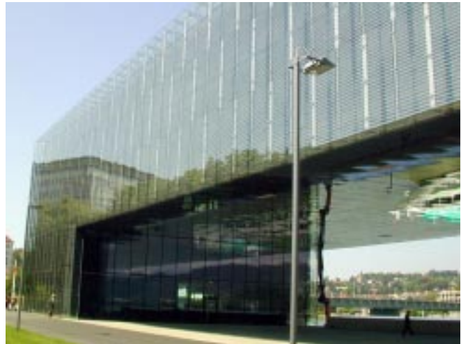
The spectacular glass exterior of the Lentos Museum.

The structure, created by the Zurich architects Weber & Hofer, provides Linz with a new museum of modern art of international status. The Lentos Museum houses collections from artists such as Klimt, Kokoschka and Schiele. The building's appearance, with 8000 sq. meters of usable floor space over three floors, is remarkable for its transparent glass casing, especially attractive when lit at night.